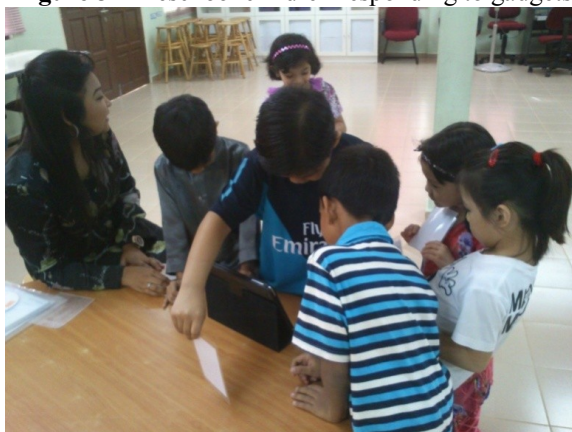
Figure 3 - Preschool children responding to gadgets

“The cards are nice. When I bring the cards to the camera, there is animal. But the animals are not moving...I want the animals to move”