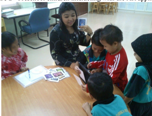
Figure 2 - Preschool children interacting with the AR application