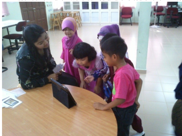
Figure 4 - Preschool children were curious and excited of the AR technology

Besides that, motivation and engagement was also evident at the end of the session, when most of the children chose not to return to their class, but rather remain at the computer lab to play with the augmented reality flashcards. Finally, motivation levels were high because children never gave up using the application although they responded the wrong answer at the beginning. This shows that, even when feedback showed that they were very wrong, nobody quit flashing the flashcards until they finished the 26 alphabets and managed to identify all of the animals correctly. Curiosity has also been another factor contributing to motivation. They were so curious while flashing the flashcards and suddenly the 3D animals appeared out of nowhere in Figure 4.